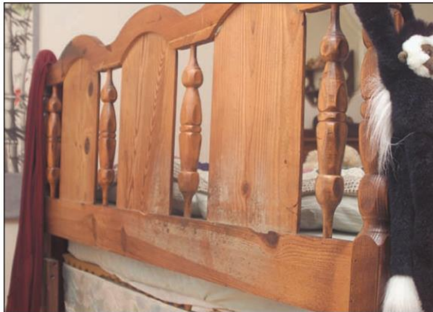
Mold growing on a wooden headboard in a room with high humidity.