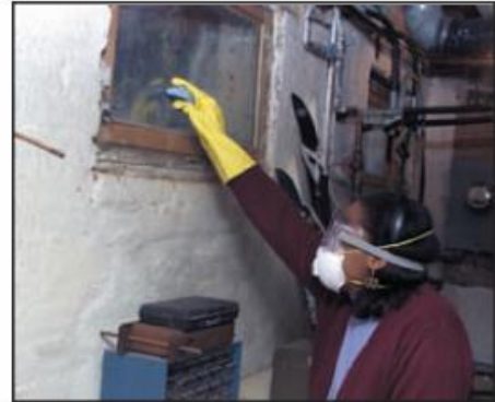
Cleaning while wearing N-95 respirator, gloves, and goggles.

How do I know when the remediation or cleanup is finished? You must have completely fixed the water or moisture problem before the cleanup or remediation can be considered finished.